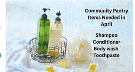
Community Pantry Items Needed in April

*Operation Christmas Child Shoeboxes March: Personal care items: toothbrushes and holders, combs or small brushes. **GOAL IS 300 OF EACH ITEM.**