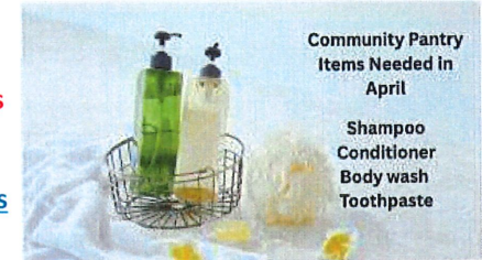
Community Pantry Items Needed in April Shampoo Conditioner Body wash Toothpaste

* Operation Christmas Child Shoeboxes May: 50 WOW items for boys and 50 WOW items for girls (age: 5-9 years).